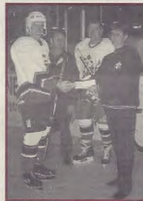
"Old Timer Game Presentation"

Within days donations and commitments were received from several local groups and organizations. While the Wheatland Mall Merchants designated their receipts from, "Pictures with Santa," the health care workers named the Foundation as the recipient of the proceeds from their Annual Christmas Social. The Royal Canadian Legion, in the meantime, committed the funds raised from Poppy sales to the Foundation for the purchase of dialysis equipment.