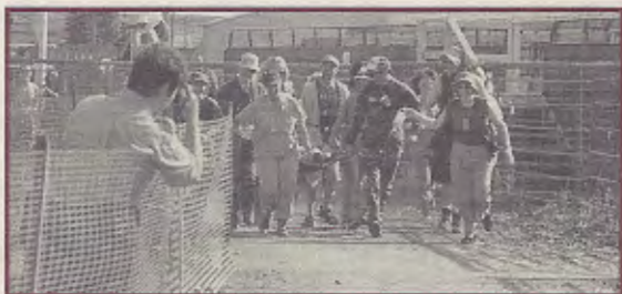
"Just going round in circles"