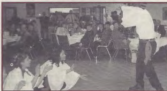
"Greek Night Entertainment"

Soon groups began to come forward expressing a desire to hold events, the proceeds of which would be donated to the Foundation in support of its' mission. The Swift Current Greek Orthodox community announced it's first annual Night Out In Greece to benefit the Foundation's purchase of equipment for the new Renal Dialysis Unit and raised over $33,000. The Bob L'Heureux Charity Golf Classic organizers indicated a portion of their receipts would be donated to the Foundation while the Swift Current