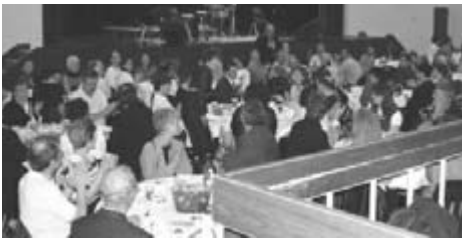
Sold out crowd waits for the Jack Semple Band to take to the stage as they enjoy a fabulous Lobster or Steak Dinner.

Great food and a festive atmosphere marked the Swift Current Rotary Club's 3rd annual Lobster Feed. The evening's entertainment was hi-lighted by a performance from the Jack Semple Band. The Foundation would once again like to thank the Rotary for their continued commitment to health care in Southwest Saskatchewan and their support of Foundation projects.