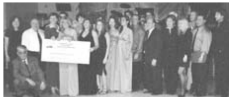
Presentation of the proceeds from the 6th Annual Night Out in Greece

Erromenon se hoi theoi diaphulattoien -- May the gods guard your well being!