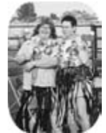
Winners of the Best Costumed Team Prize