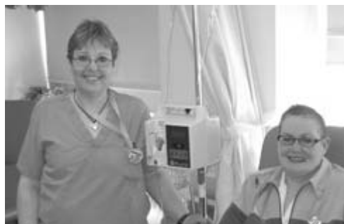
3/4 Portion IV Pump - Chemo Cypress Regional Hospital