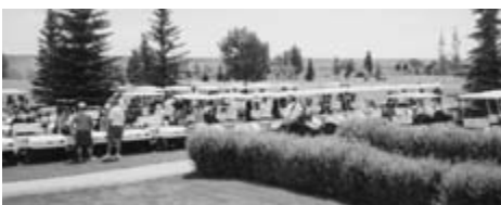
Golfers get ready to roll at the 3rd Annual MNP Golf Tournament

Bright sunny skies and 112 enthusiastic golfers were the order of the day at the 3rd Annual Meyers Norris Penny Golf Tournament. Golfers enjoyed a round of 18-hole, par 3 golf and then retreated to the clubhouse for a BBQ steak supper and tons of prizes! $16,000 was raised in support of Foundation initiatives. The Foundation wishes to thank Meyers Norris Penny for organizing another terrific fundraiser. Your continued support is greatly appreciated!