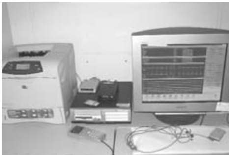
Cardiac Monitor Maple Creek Hospital

Each year, the Foundation receives a prioritized list of all needed equipment for the 17 facilities of the Cypress Health Region. All items that appear on this equipment list do not have any other source of funding but are still absolutely essential to patient care. All of the pieces announced last year are installed and fully operational at the facility indicated.