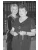
Foundation Volunteers at the Gala