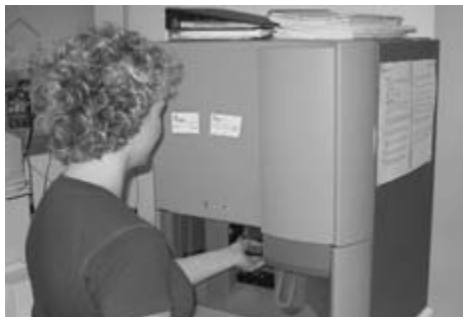
Hematology Analyzer - Eastend Wolf Willow Center & Leader Hospital