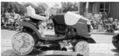
A bandaged and splinted tractor shows support for Rural Healthcare

Early in 2004, it was decided that the Foundation would participate in the Frontier Days parade. When we heard that the theme for the parade that year was "Agriculture in the World Around Us" we decided that it would be a perfect opportunity to raise awareness of our most recent annual campaign, "Supporting Healthcare in Rural Saskatchewan". Bandaged John Deere tractors were the centerpiece of our entry. Special thanks to JayDee Equipment for their support. What a great way to get out and interact with the public while promoting rural health care!